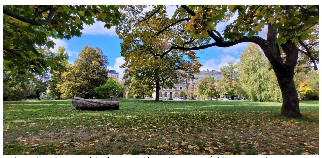
Saski Garden – location of the former Beck's garden, 2022 r.

It also remained in the hands of the occupiers during the Warsaw Uprising, when a large part of the tree stand and most of the garden buildings were destroyed. In 1948, the park was restored and rearranged according to a design by Alina Scholtz in cooperation with Romuald Gutt.