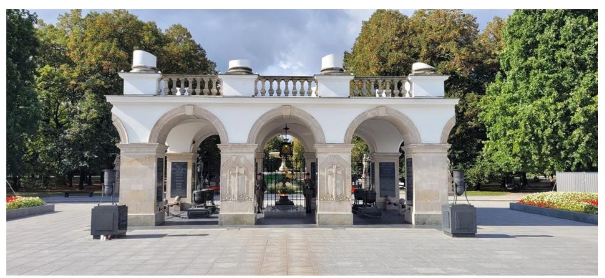
The Tomb of the Unknown Soldier, 2022.

of honor at the Tomb of the Unknown Soldier is manned 24 hours a day, all days of the year, and this will also be the case during the implementation of the investment.