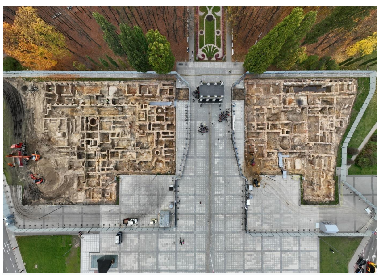
Relics of the former buildings of the Saski Palace, 2022.

In recent years, archaeological research has been carried out on the investment area of the preserved architectural relics of the buildings located within the outline of the former Saski Palace and two tenement houses (Królewska 6 and Królewska 8). Currently, the unveiling of relics is planned within the area of the Brühl Palace and the Lessel tenement house (Królewska 10/12).