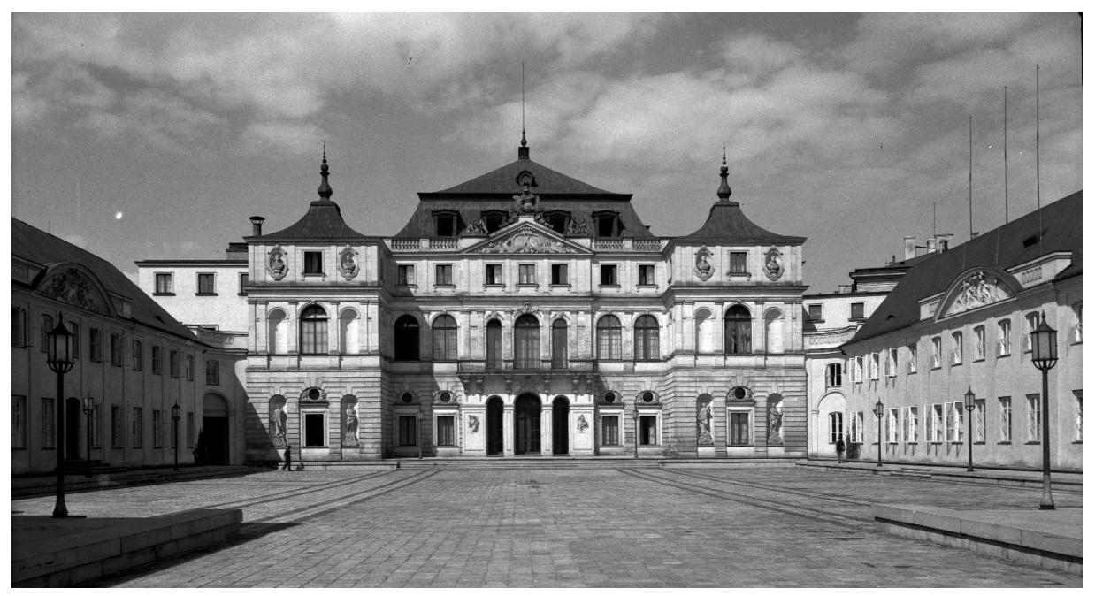
Brühl Palace, 1939 r.