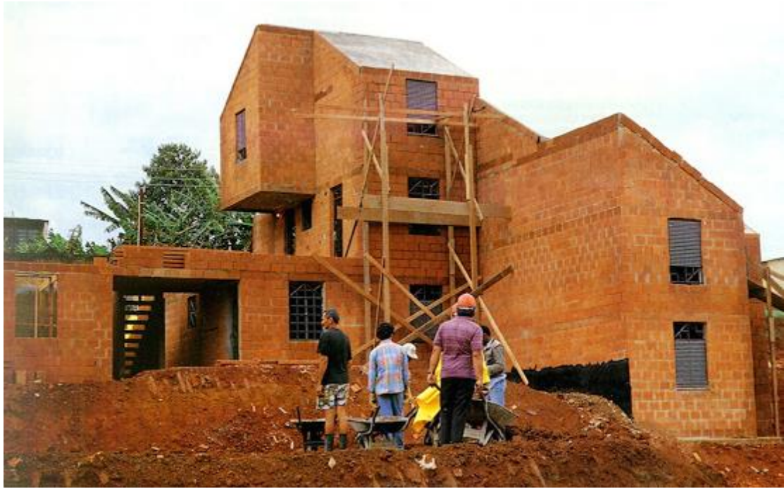
Participatory construction of the São Francisco settlement in Sao Paulo, 1991