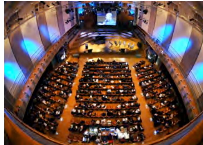
ACE Conference at The Flagey, Brussels Renovation by Philip Samyn Architects