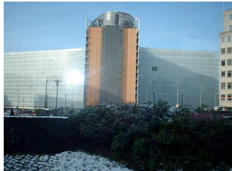
Berlaymont - HQ of the European Commission Brussels Art+Build Architects