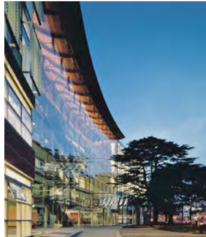
Fingal County Offices, Swords, Ireland Bucholz McEvoy Architects