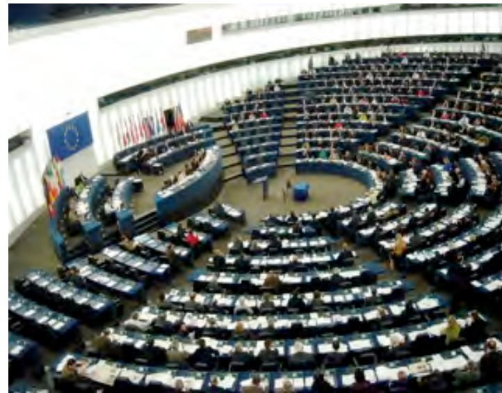
Main Chamber - European Parliament - Strasbourg Architecture Studio Europe, Architects