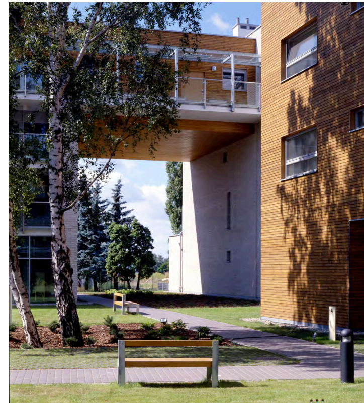
Eko Park - Kurlyowicz Architects, Poland

To speak with a single voice on behalf of the profession