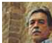
Paulo Mendes da Rocha