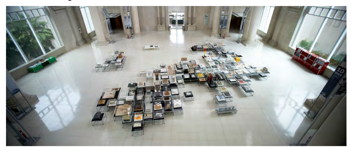
Exhibition showing the models from the collection