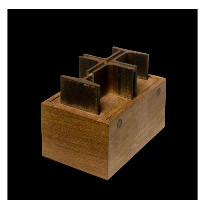
European Union Prize for Contemporary Architecture Mies van der Rohe Award 2015