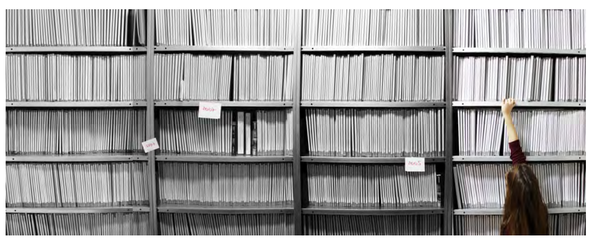
Archive including 2,500 works since 1988